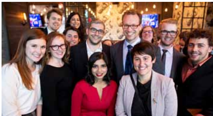
MLA, Minister Schmidt with CAUS Members