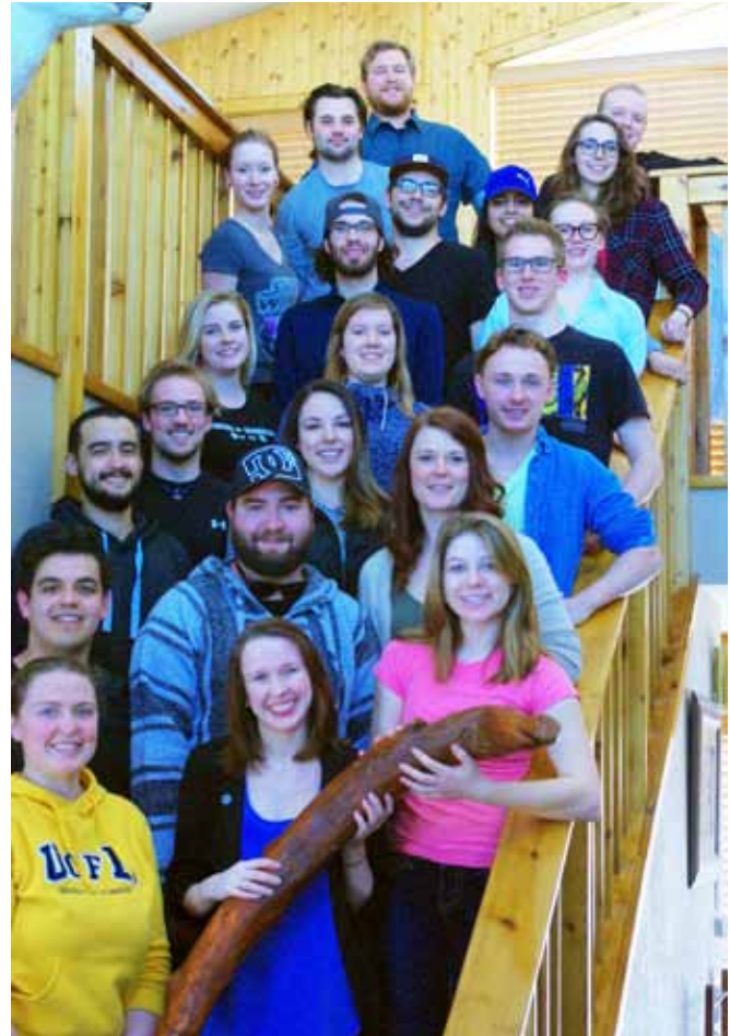
Outgoing & Incoming Executive Council & General Assembly