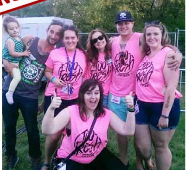
Fresh Fest Volunteers