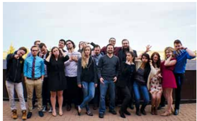
Spring 2016 Election Candidates